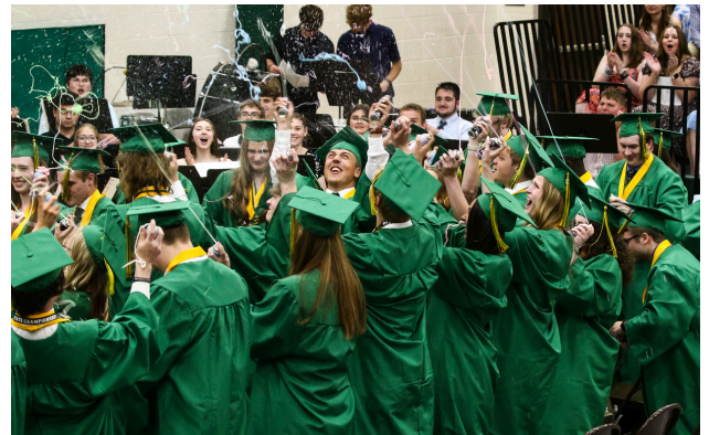
The Crusader Class of 2024 celebrates with silly string at the commencement service.

Regardless of the next path they have chosen, it is our prayer as a faculty and staff that each graduate feels prepared for lives of Christian leadership. When asked to reflect on their experience at Sheboygan Lutheran High, here is what a few new Crusader graduates had to say: